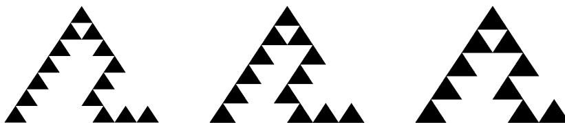
Figure 1. K_1 .

There are two other variants K_2 and K_3 (Figures 2, 3) that are similar, K_2 has 13 maps with contraction ratio \rho = \frac{1}{6} , K_3 has 10 maps with \rho = \frac{1}{5} (see [11]).